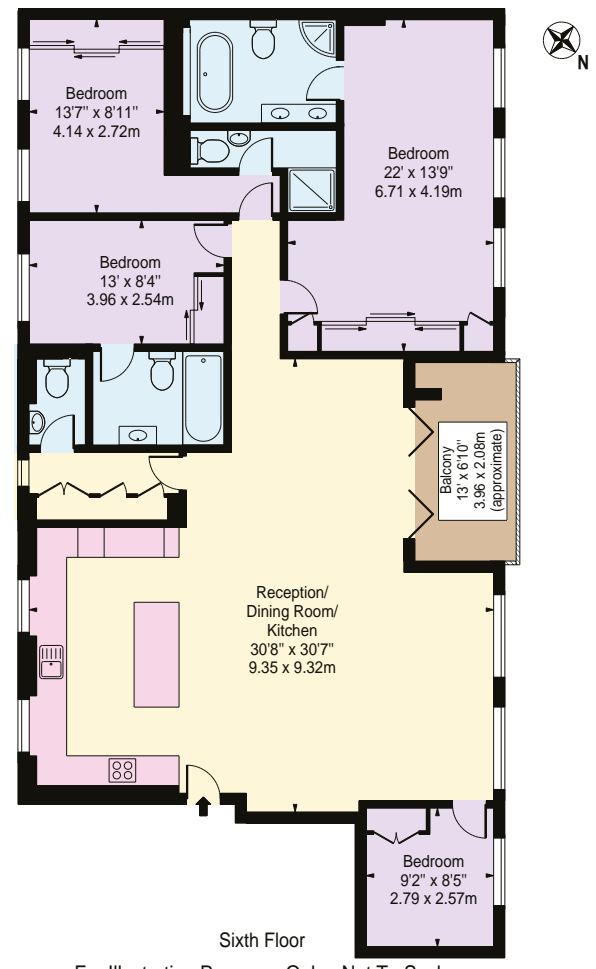
Praed Street Approx. Gross Internal Area 1605 Sq Ft - 149.11 Sq M

For Illustration Purposes Only - Not To Scale